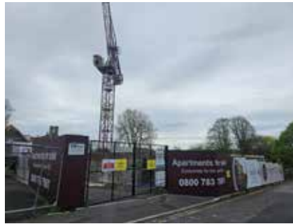
The building site in Page Road with its crane

After work was paused the developer posted a message on its website, which said: