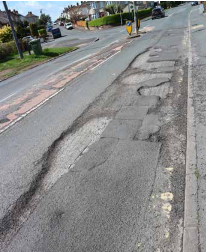
Potholes near the Northcote Road, Peache Road and Salisbury Road junction