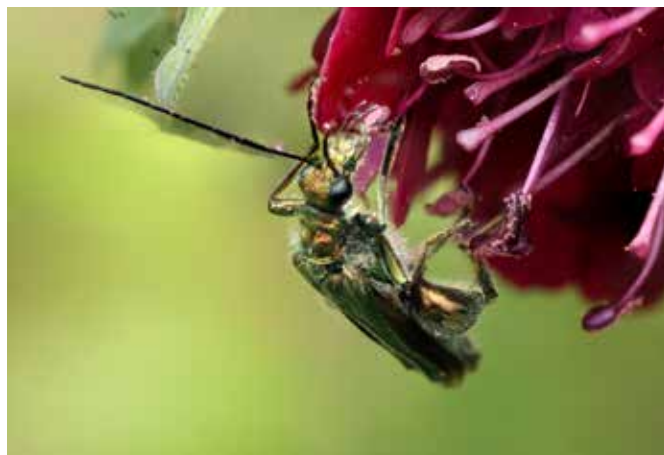
■ Swollen-thighed beetle by Ian JoŪstone