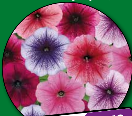
Bedding Plants 20 PLANTS