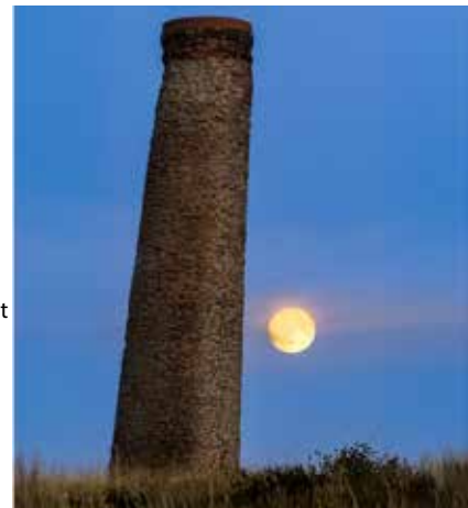
■ Troopers Hill