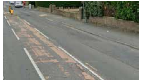
What the same stretch of road looked like in August last year

Further afield, resurfacing is also planned on Badminton Road, north of the M4 between Cuckoo Lane in Winterbourne and Church Road in Frampton Cotterell, and on Pound Road in Kingswood.