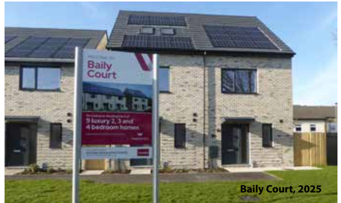
Baily Court, 2025

Now the Wottons site is part of a small new development of nine houses in Dial Lane called Baily Court, as seen in the second picture, taken last year. Enjoy your trip down memory lane!