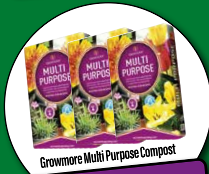
Growmore Multi Purpose Compost