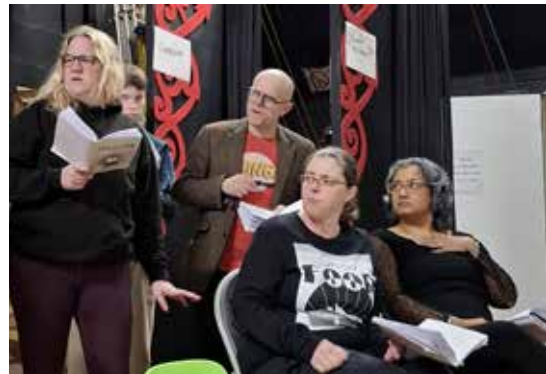
The cast in rehearsal

The venue has a bar and there is a raffle taking place during the interval of each show.