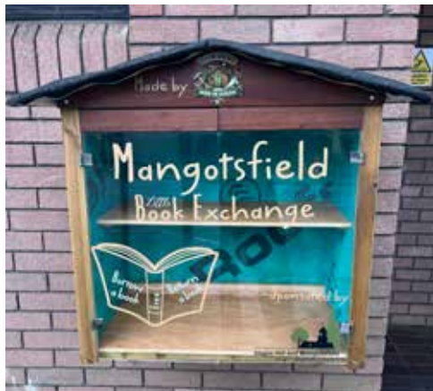
The book exchange unit.