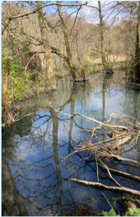
The nature area.

Numerous people have searched filing cabinets, old records and websites, to no avail.