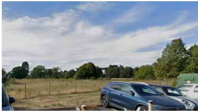
Land next to Frenchay Brain Injury Rehabilitation Centre was earmarked for a community hospital