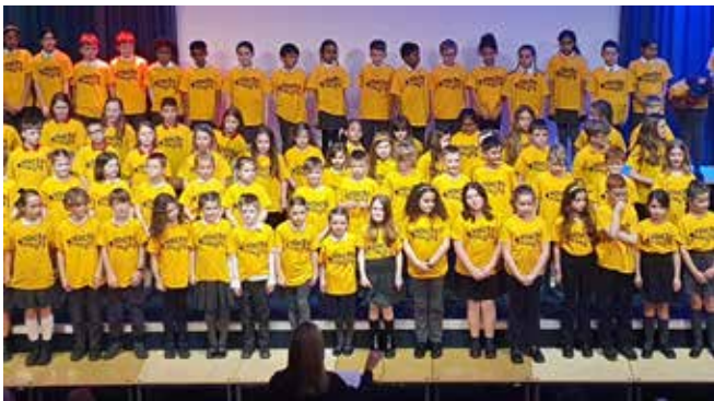
Singers at the Voices for Life concert