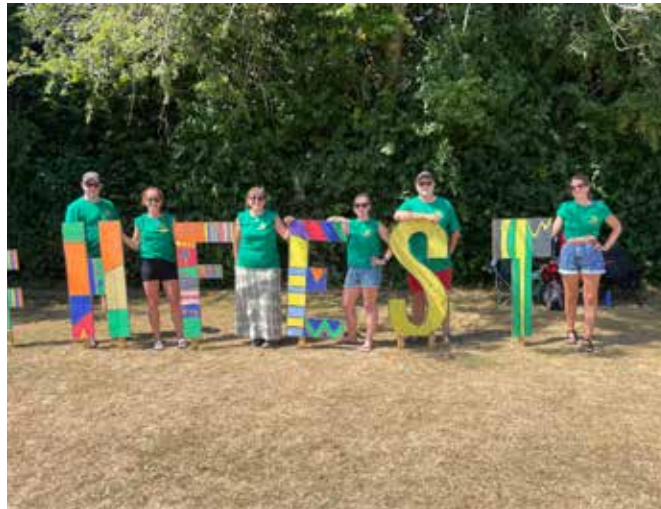
Heathfest organisers with the festival logo

featuring crafts, local businesses, a range of food and drink, offering something for every taste and interest.