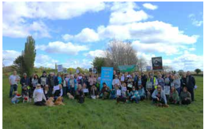
Protesters on the former Shortwood Golf Course at the end of the SOGS-SG march

The most recent application has been made on behalf of David Wilson Homes for 260 homes on land north of the