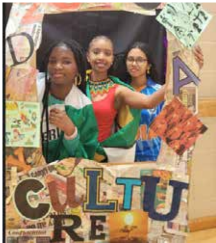
Traditional costumes and national colours in the school's celebration day

Mrs Blackmore said: "The week celebrates the school's many different cultures, with