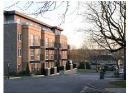
Churchill Living's plan for the finished building

where work has not been taking place as previously predicted.