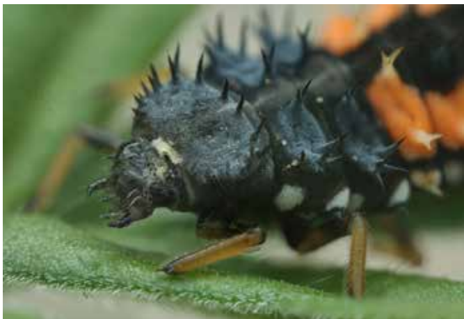
■ Ladybird larva