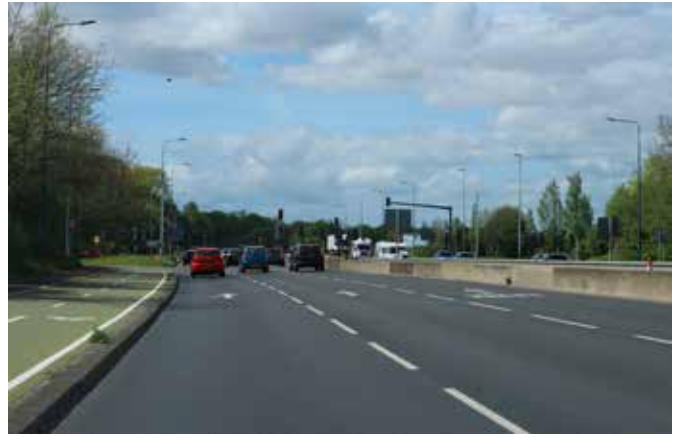
Concrete barriers preventing right turns at the Hambrook junction are being removed

A petition drawn up by a Moored resident in 2024 gained more than 4,400 supporters, and in the same year