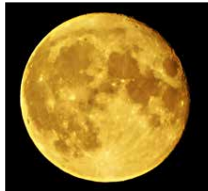
■ A Cratered Face by Sid Stace