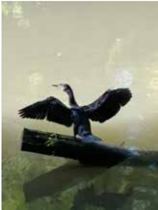
Cormorant in the River Frome.