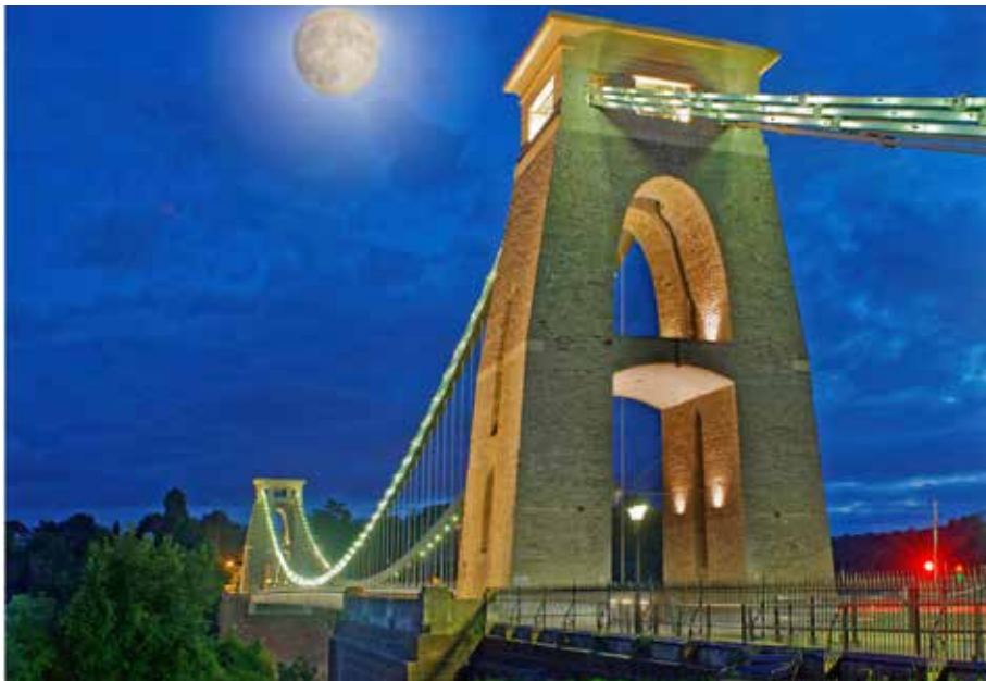
■ The Clifton Bridge Moonlit