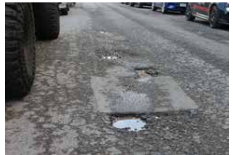
Potholes on South View