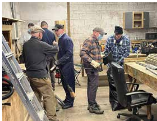
Men in Sheds members at their new base

We are facing two predominant challenges. Firstly, balancing the need to continue contributing to the community, building/creating wooden items that will improve the lives of those living locally, and selling items that will fund our future work. Secondly, preparing the unit for our imminent move.