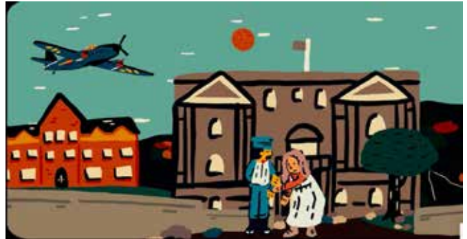
Images from the new Downend CHAP video, showing a miner and the Cleve Hill House during its use as a wartime hospital.

LET US KNOW YOUR VIEWS - EMAIL US AT: NEWS@DOWNENDVOICE.CO.UK