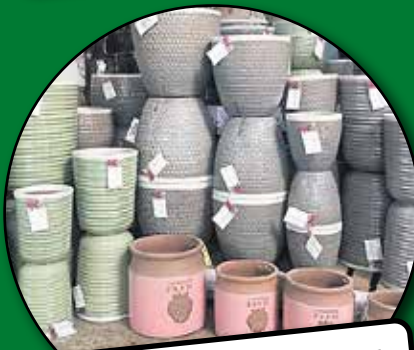
Large selection of Ceramic Pots