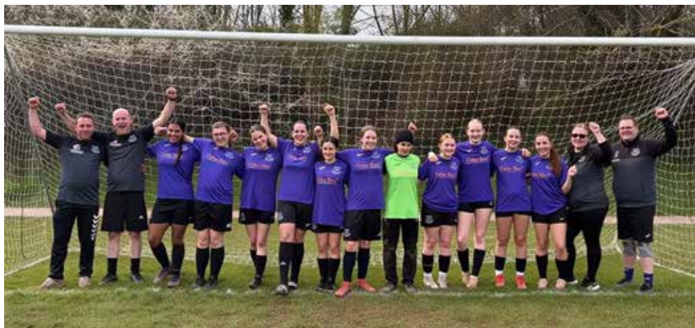
Downend Flyers' U16 Giants side

The club also extends its thanks and best wishes to those