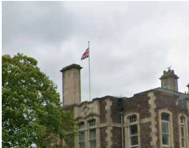
The Union flag flying on top of Cossham Hospital in August last year

But when the rope used to raise and lower the flag broke over the winter they were told by North Bristol NHS Trust that it could not be replaced on safety