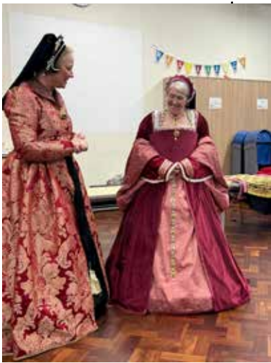
Tudor Royal Experience